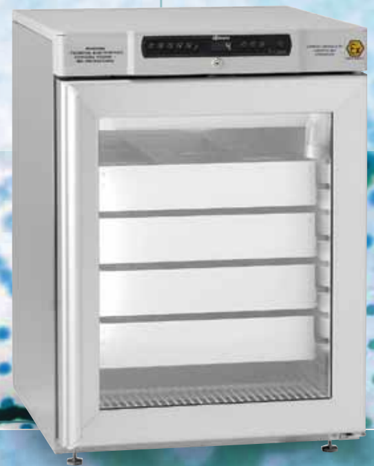
BioCompact II RR210. Drawers and glass door are optional extras.

Available in either white or stainless steel finish, with a one-piece moulded ABS inner lining. Shelves and drawers are mounted in U-shaped rails moulded into the plastic walls.