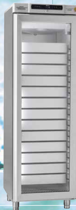
BioCompact II RR410. Drawers and glass door are optional extras.

Available in either white or stainless steel finish, with a one-piece moulded ABS inner lining. Shelves and drawers are mounted in U-shaped rails moulded into the plastic walls.